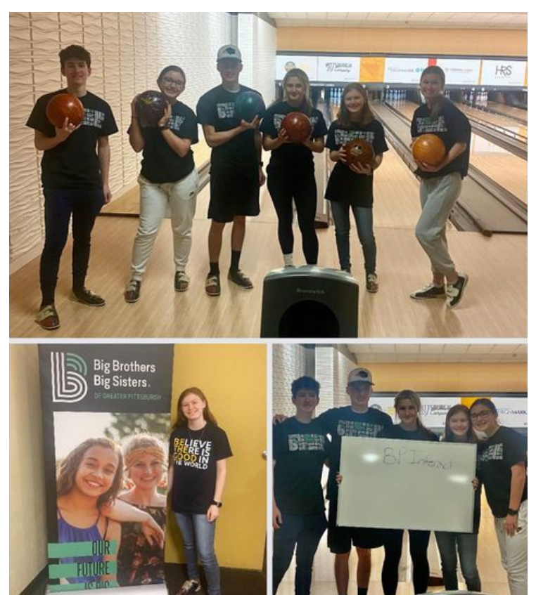
Members of the Bethel Park Interact Club had a blast at the Big Brothers Big Sisters Bowling Fundraiser!

As we close out the current Rotary Year on June 30, we start a new Rotary Year on July 1! Here is the new theme logo for the 2022-2023 Rotary Year