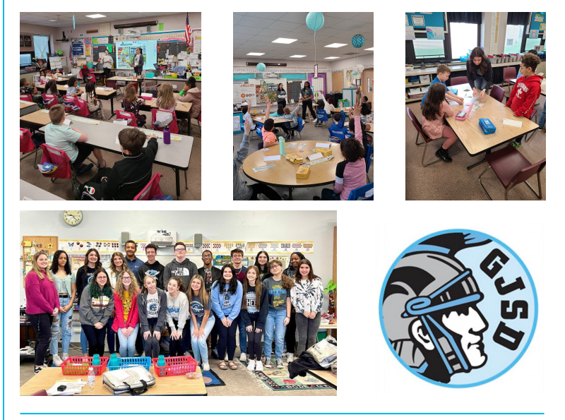
The Interact Board of Directors and the District Leadership of Rotary District 7305 CONGRATULATE all of the 2022 Graduating Interactors..

We would also like to thank the wonderful 2nd grade teachers for allowing us into their classrooms! We hope that all of the students and their teachers had as much fun as we did!